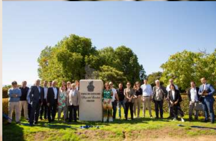
VINHA DO CONTADOR GRANDE JÚRI 2021