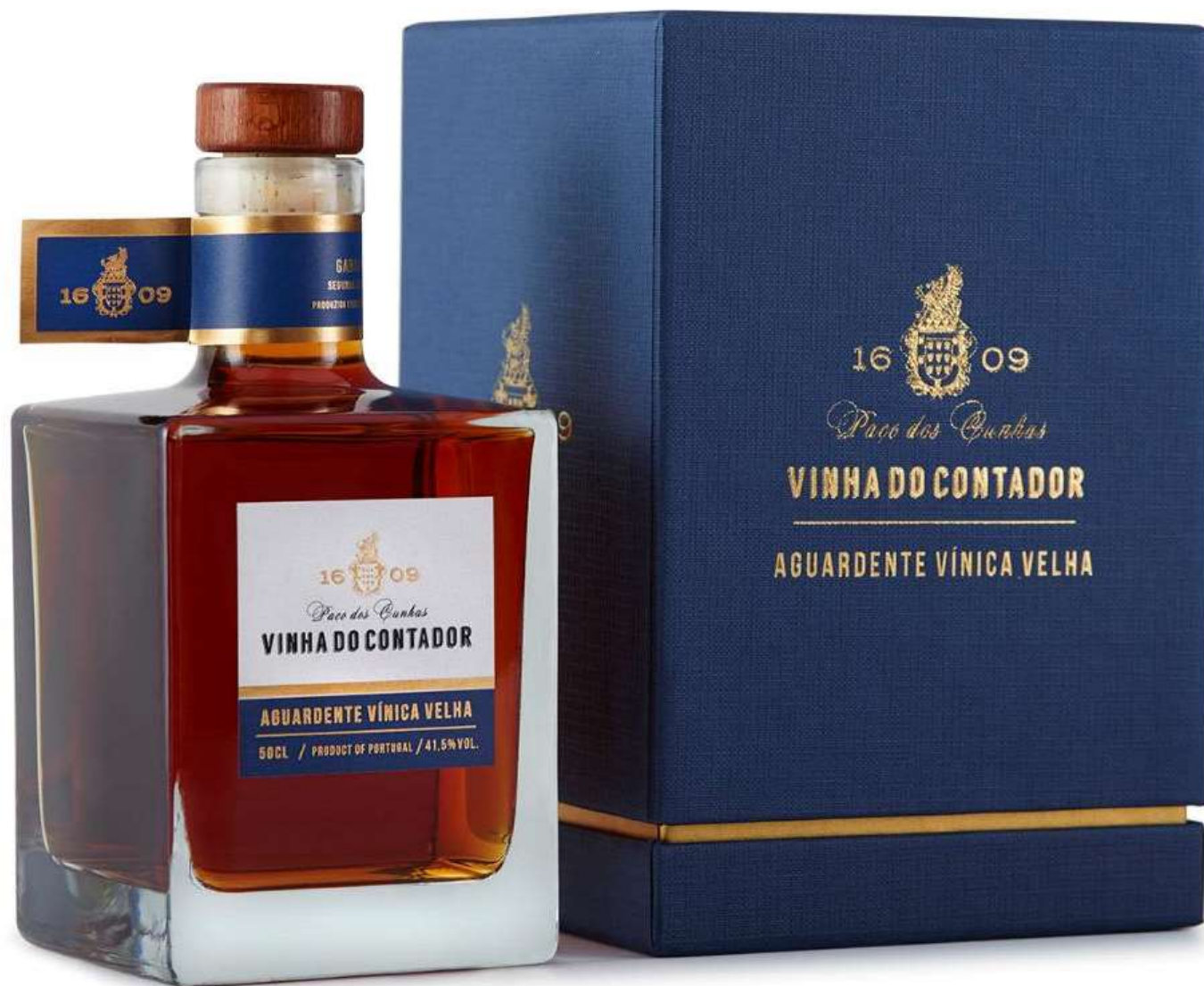
VINHA DO CONTADOR OLD BRANDY 1 x 50 cl