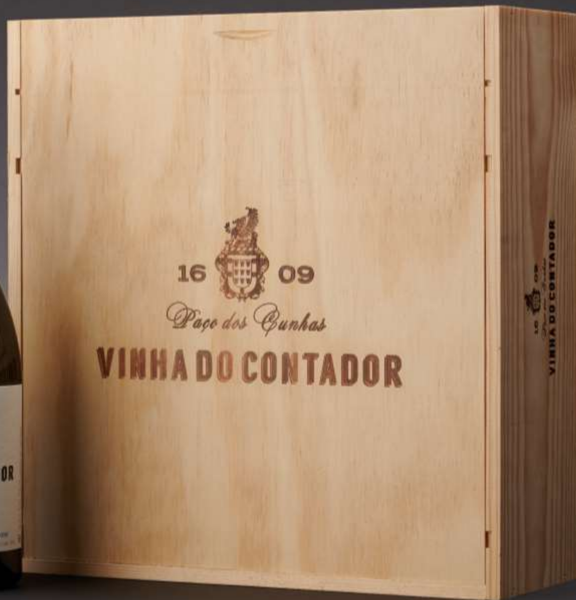
VINHA DO CONTADOR GRANDE JÚRI DÃO NOBRE NOBRE WHITE WINE. 3 x 750 ml